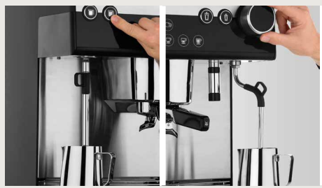
Milk foam preparation (fully-automatic using the manual steam wand)

Brew time monitoring with software-assisted grinding degree setting