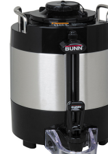
TF SERVER, 1G/3.8L MECH NOBASE