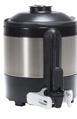
TF SERVER, 1G MECH NOBASE GEN3