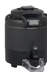
TF SERVER, DSG2 1G BLK NOBASE