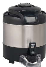
TF SERVER, DSG2 1G SST CD NOBAS