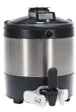
TF SERVER, 1G DSG NOBASE GEN3