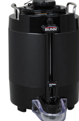
TF SERVER, 1.5G/5.7L MECH BLK NOBASE