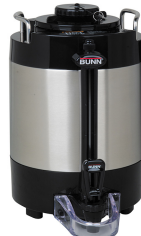
TF SERVER, 1.5G/5.7L MECH NOBASE