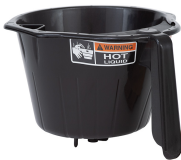
FUNNEL ASSY, SMART COFFEE BLK-CLEARED Product #: 53463.0021