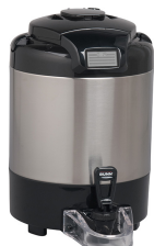
TF SERVER, DSG2 1.5G SST NOBAS