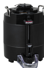
TF SERVER, 1G/3.8L MECH BLK NOBASE