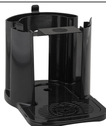
STAND ASSY, TF SERVER