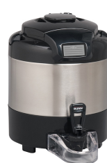
TF SERVER, DSG2 1G SST NOBASE