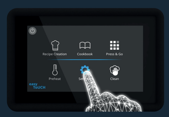
Multi lingual - operates in over 37 languages

Connect to Wi-Fi and ethernet in settings, register and connect all your ovens on our online KitchenConnect portal, then efficiently update and remotely send out your menus.